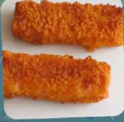
COD FISH FINGERS